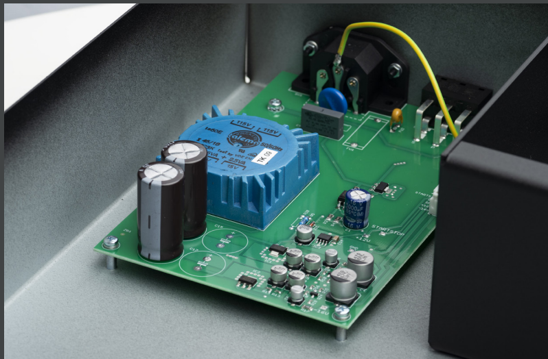
Special Phono Stage PSU Design with Low Core Saturation Toroidal Transformer to Minimize Electromagnetic Radiation

M3x ViNYL has a steel chassis and a thick, heavy aluminium frontplate, which brings outstanding rigidity to the entire system and at the same time splendid isolation against outside interference. Key factor in keeping signal to noise ratios on the highest possible level is the huge distance between power transformer and amplifier section. The quality of the outside chassis finish, which is beyond beautiful, as well as the electronics inside - all wired by hand - is maintained by the highest manufacturing standards which we now achieve by fully switching the production to be entirely Made in the EU!